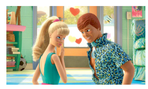
Barbie & Ken (http://www.google.co.uk/imgres?q=barbie+toy+story&um= 1&hl=en&safe=active&sa=N&rls=com.microsoft:engb&tbm=isch&tbnid=KHH-asvI_K3gfM:&imgrefurl=)

Exam Hint: When analysing representations of characters within film, deconstruct the 'film language' used to construct the representation. This could include visual codes such as costume, hair, make up, setting and props or technical codes including camera shot /angles, soundtrack and editing techniques.